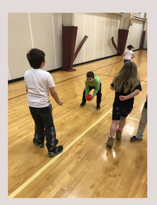
Voyagers are currently working on how to correctly field a ball.