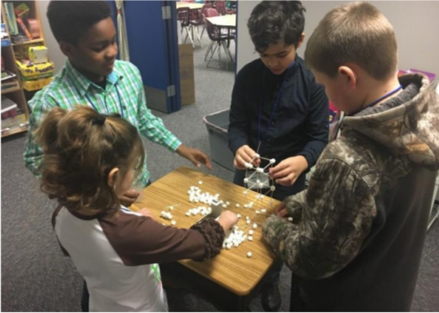
← Building Structures!