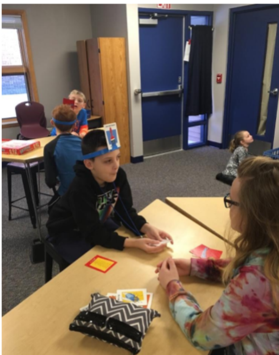
↑ Who doesn't love Headbands?!